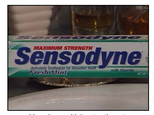
Use desensitizing toothpaste