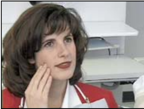
Your comfort is essential

It takes two or more appointments to restore a damaged tooth with a porcelain crown. That's because a crown is fabricated in a dental laboratory to precisely fit your tooth.