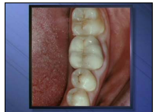
A natural looking result

During your next visit, we remove the temporary crown and place your new crown. We check the fit and your bite. When everything looks good, we cement it in place and you'll have a new porcelain crown.