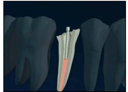
Post in place

Sometimes, when a tooth has broken off due to fracture or decay, there's simply not enough of your natural tooth remaining to place a crown. Fortunately, we can replace the missing portion and save your tooth by placing a post inside your tooth, which will then anchor a filling material, called a core.