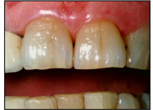
Cracked tooth syndrome

Cracked tooth syndrome is a term that describes recurring discomfort, sensitivity, or pain that is caused by an incomplete fracture or crack in a tooth. The fracture involved in cracked tooth syndrome is often difficult to detect and may be completely invisible to the naked eye. It may not even appear on an x-ray.