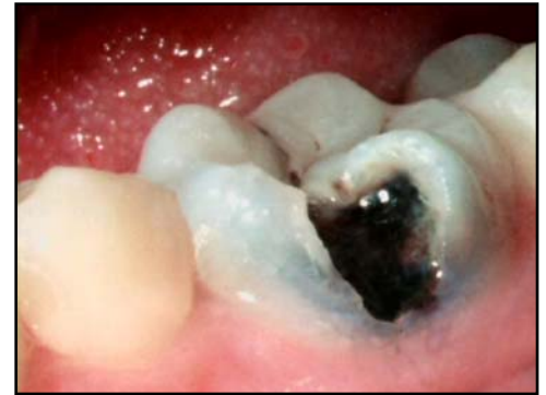
Major tooth structure lost