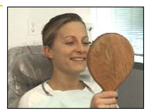
An attractive solution

So if you're looking for an attractive and effective option for restoring one or more decayed teeth, be sure to ask us about the latest choices in white restorative materials.