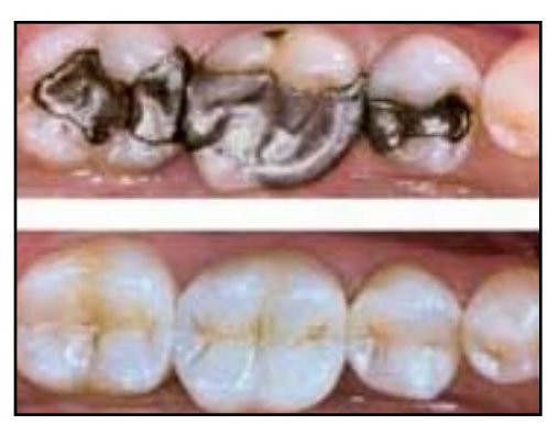
White fillings blend in beautifully

Amalgam fillings absorb mosture and expand and contract with heat and cold. So, as the filling ages, it can fracture your tooth; we'll then need to place a crown on your tooth to save it. Also, silver fillings often undergo metal fatigue, corroding and leaking over time. This destroys the protective seal of the filling and allows new decay to develop underneath it. This leakage can give a gray appearance to the entire tooth.