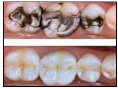
Natural looking results