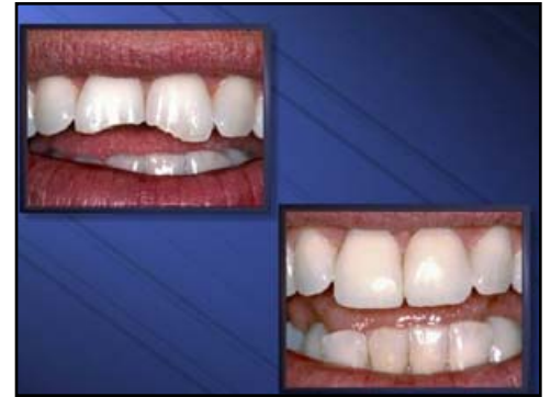
We can repair chipped or broken teeth

The goal of cosmetic dentistry is to transform an average smile into a terrific smile! To accomplish this goal, we analyze every aspect of a smile and then correct the problem.