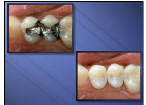
We can replace silver fillings with white

All of these problems can be solved with cosmetic procedures, so even if you weren't born with a beautiful smile, you can still have one.