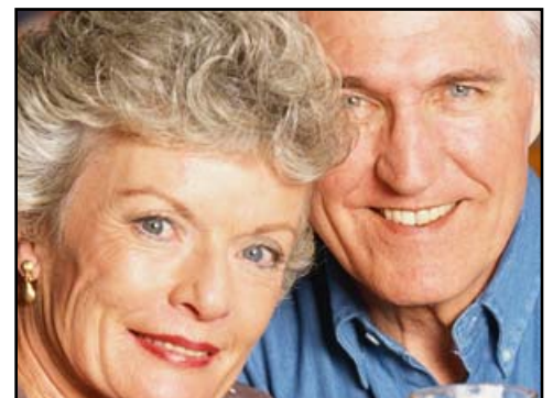
Smile with confidence

During your final visit, we remove the temporary bridge and try in your new bridge. We check the fit and your bite, and when everything looks good, we cement your new porcelain bridge in place.